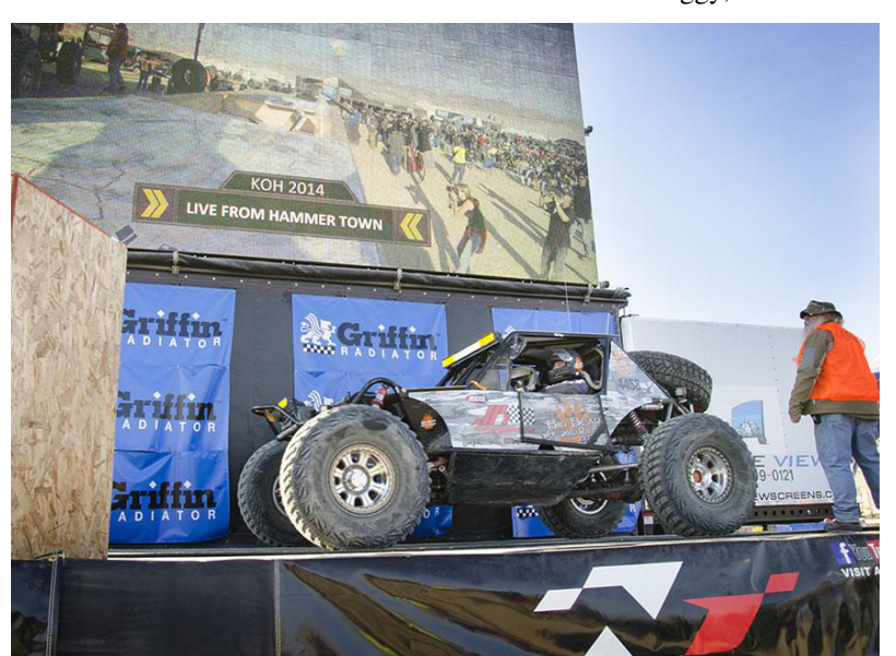
NOT be where we are today is our Awesome Sponsors!!!

And for the Back Bone of the BBOR Buggy, which we could