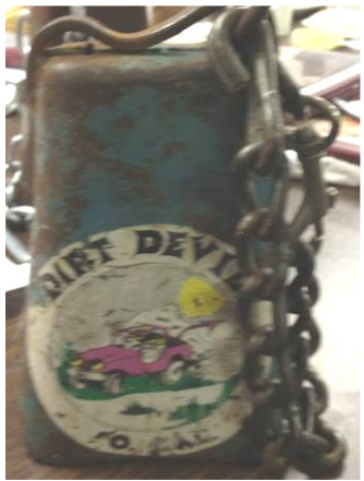
1 Old green cow bell.

Cowbell 3 John Strege July 2012 earned while playing in the 4x4 area in Hungary Valley