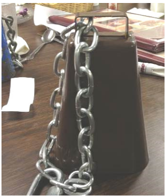
3 new brown bell

The cow bell rules are: If you get stuck and are unable to move under your own power and need the help of a winch or you get strapped from one of your fellow jeepers then you have earned the privilege of hanging a cow bell from your front bumper. You must leave the cow bell on the front of your rig until another Dirt Devil gets stuck then, you can proudly hand it over.