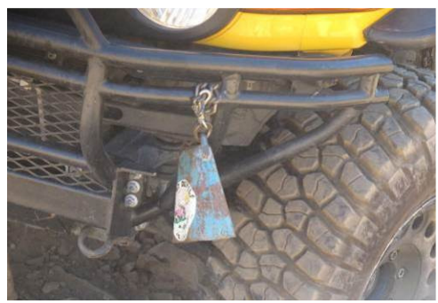
Proudly displaying the Cow Bell.

The cow bell rules are: If you get stuck and are unable to move under your own power and need the help of a winch or you get strapped from one of your fellow jeepers then you have earned the privilege of hanging a cow bell from your front bumper. You must leave the cow bell on the front of your rig until another Dirt Devil gets stuck then, you can proudly hand it over.